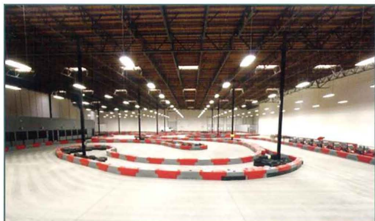
MB2 Raceway features karts with speeds up to 50 miles per hour on a one-mile-plus indoor racetrack.