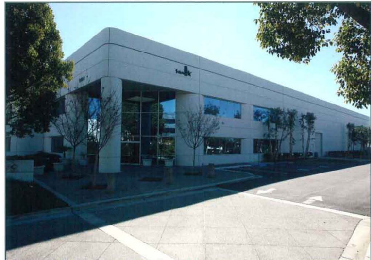
The pictured building at 9600 Toledo Way is part of Irvine Business Park, a 170,306 square-foot property in Irvine, and being marketed by the Hartel Turner Team.

The four out of the nine new properties being marketed by the Hartel Turner Team are: