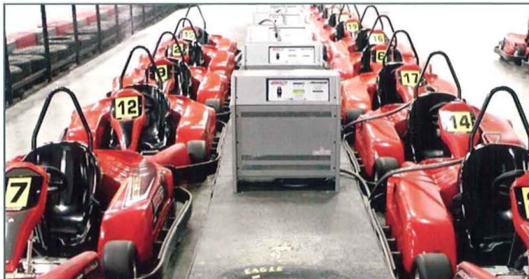
MB2 Raceway's main business is holding corporate events with catering facilities. More information is available at www.mb2raceway.com .