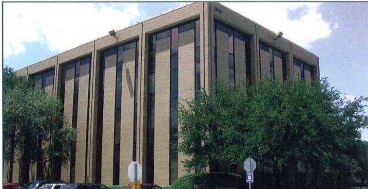
Voit Commercial's Irvine office represented Foremost Fountainview, L.P. in the sale of two multi-tenant office investment properties in Houston, Texas.